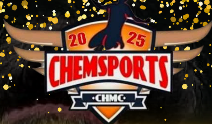
TABLE TENNIS WOMEN'S