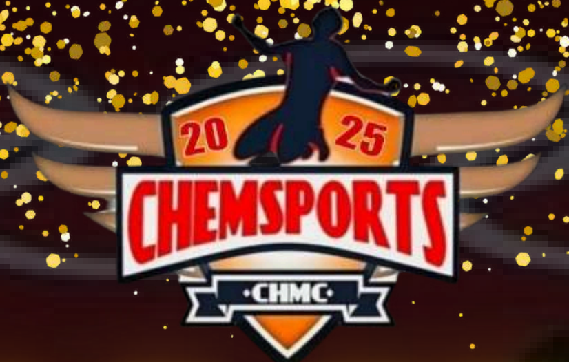
TABLE TENNIS MEN'S